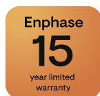
15-year limited warranty